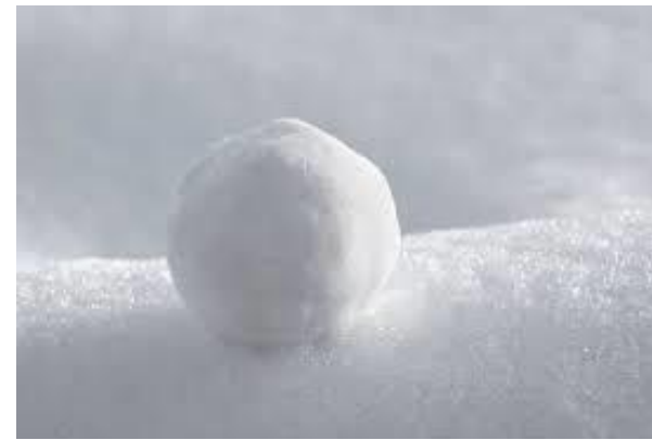
Hižə kira-only one